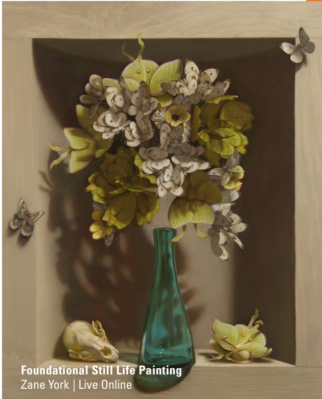
Foundational Still Life Painting Zane York | Live Online

Fall Classes Begin Online: September 7 th In-Person: September 14 th